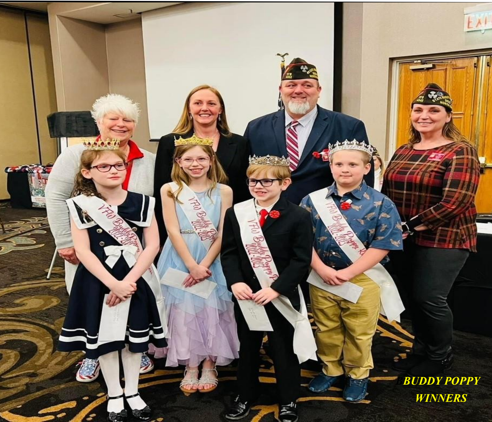
BUDDY POPPY WINNERS

Official Publication of the Department of North Carolina Veterans of Foreign Wars